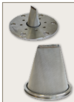
Gas safety filter