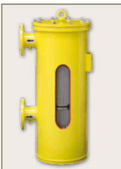
DF1040 Natural gas fine filter