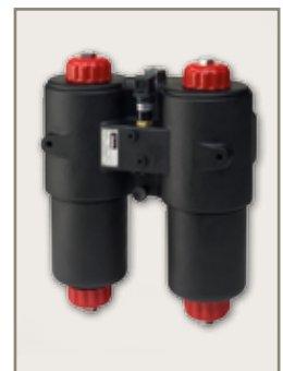
DF40 Micro-pilot fuel filter