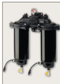
DFBO Water separator / fuel filter