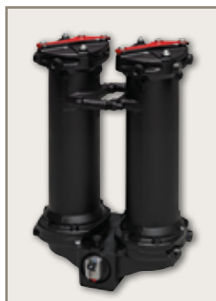
DF65 Main liquid fuel filter